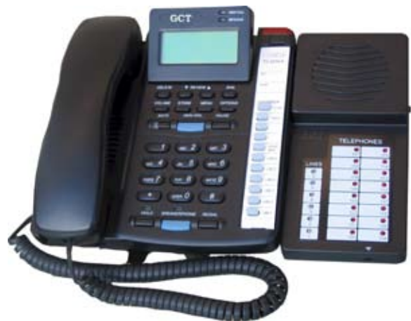
TC-2210-K Operator Station

Public Announce - Use the operator console or connect an external powerful amplifier.