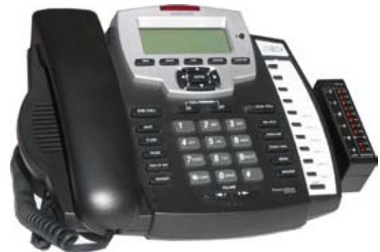
TC-125-K Display Speakerphone